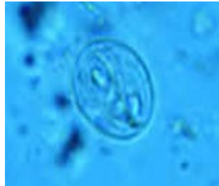
Giardia cyst photograph courtesy of Centers for Disease Control and Prevention (CDC)